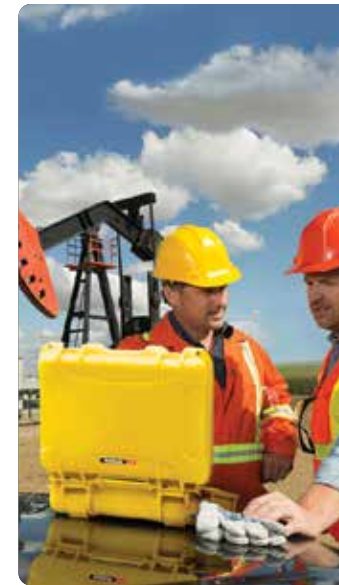
Commercial / Industrial