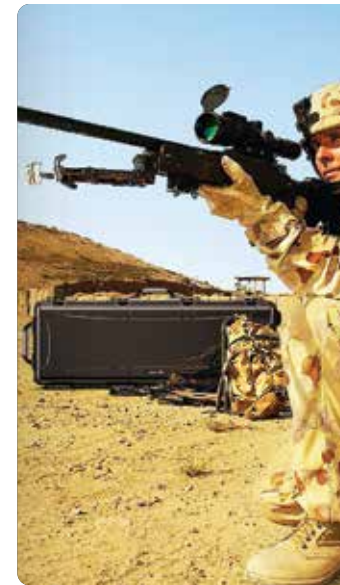
Military / Law enforcement